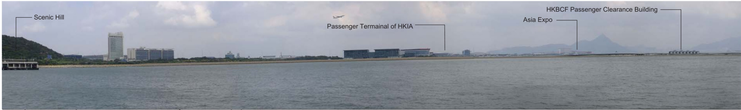
Development without Mitigation (Day 1 of Operational Phase)