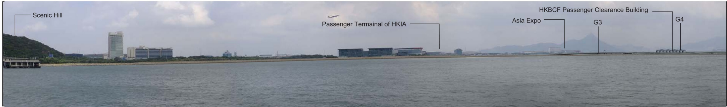
Development with Mitigation (Year 10 of Operational Phase)

Note: Reference to Landscape and Visual Impact Assessment (Ref. 072-02)