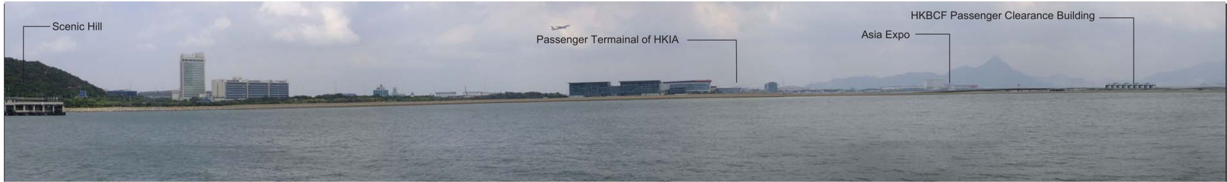
Development with Mitigation (Day 1 of Operational Phase)