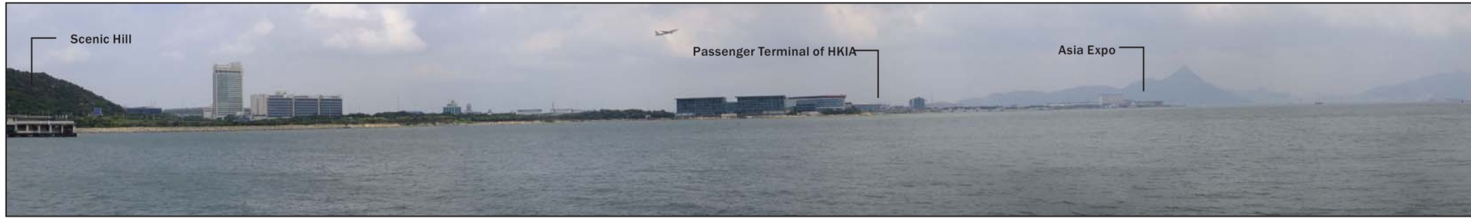
Existing Baseline Condition - Viewing Towards HKBCF (Day 1 of Construction Phase)