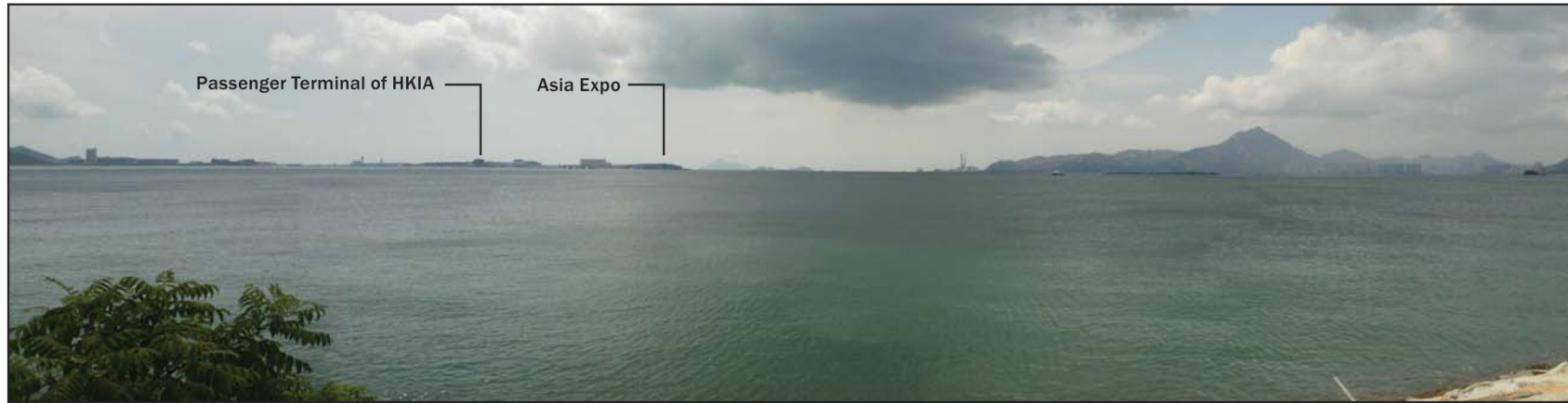
Existing Baseline Condition - Viewing Towards HKBCF (Day 1 of Construction Phase)