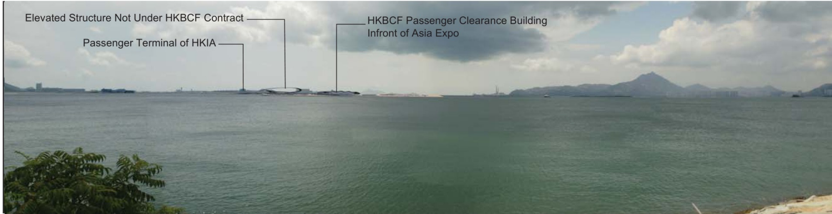
Development without Mitigation (Day 1 of Operational Phase)