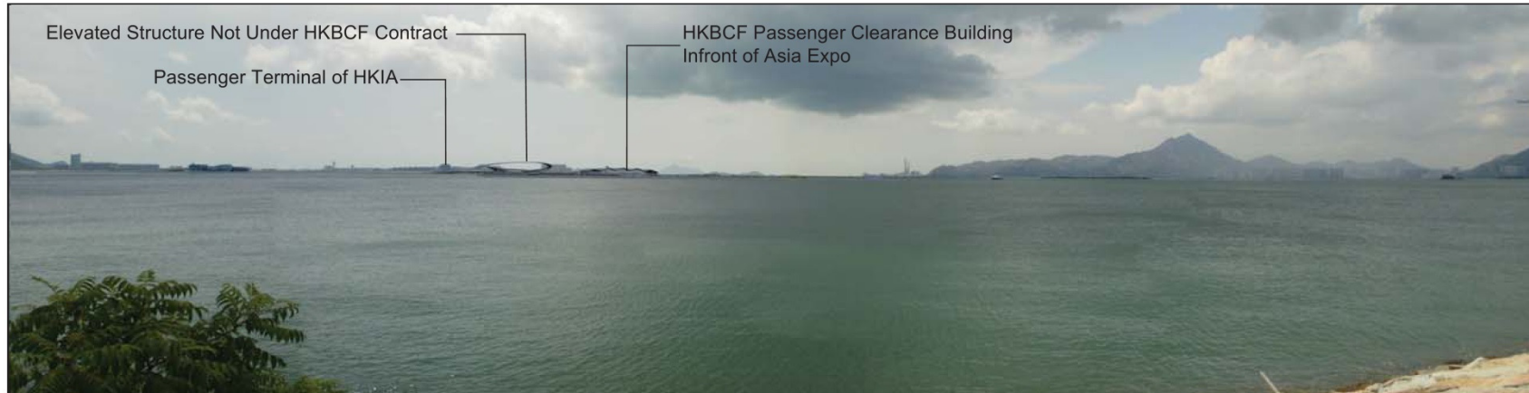
Development with Mitigation (Day 1 of Operational Phase)