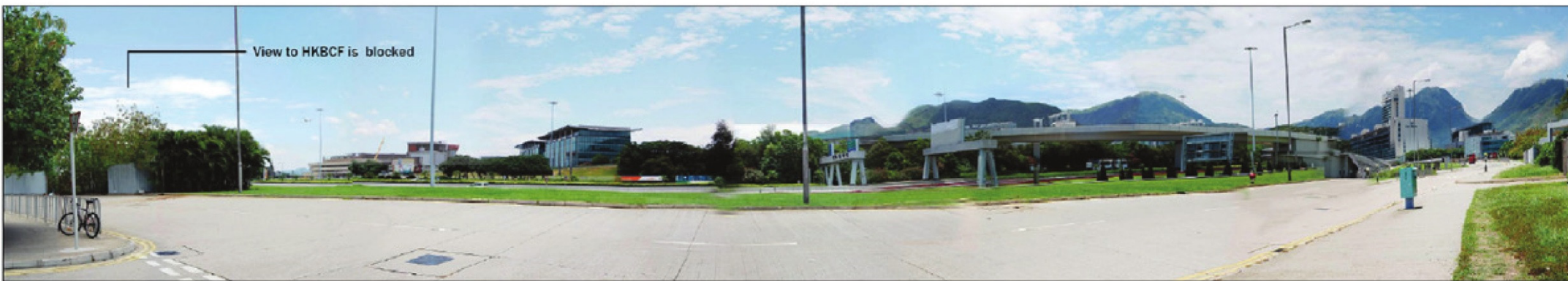
Development with Mitigation (Day 1 of Operational Phase)