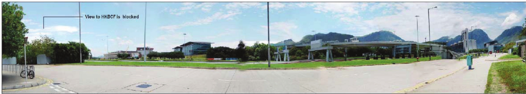
Development with Mitigation (Year 10 of Operational Phase)

Note: Reference to Landscape and Visual Impact Assessment (Ref. 072-04)