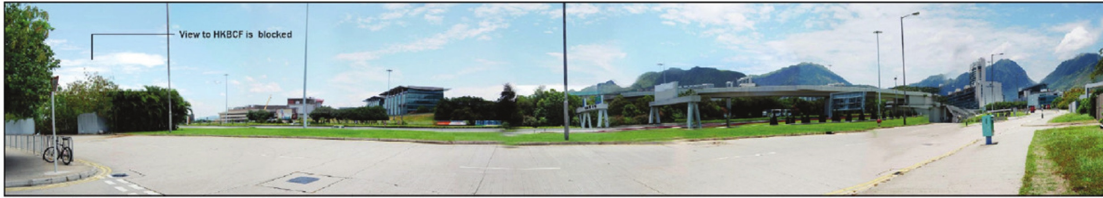
Existing Baseline Condition (Day 1 of Construction Phase)