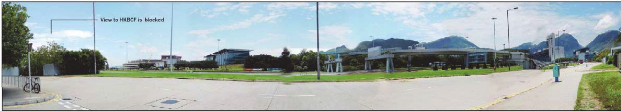
Existing Baseline Condition (Day 1 of Construction Phase)