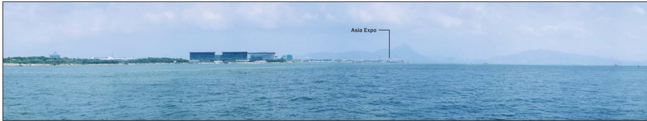
Existing Baseline Condition - Viewing Towards HKBCF (Day 1 of Construction Phase)