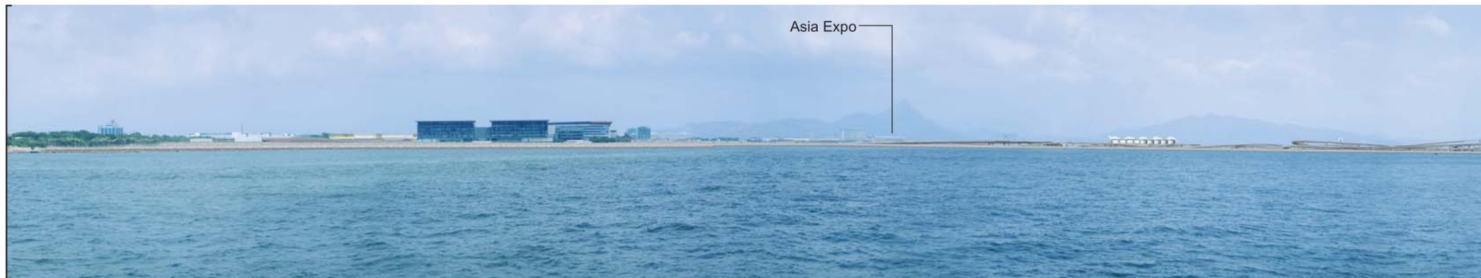
Development with Mitigation (Day 1 of Operational Phase)