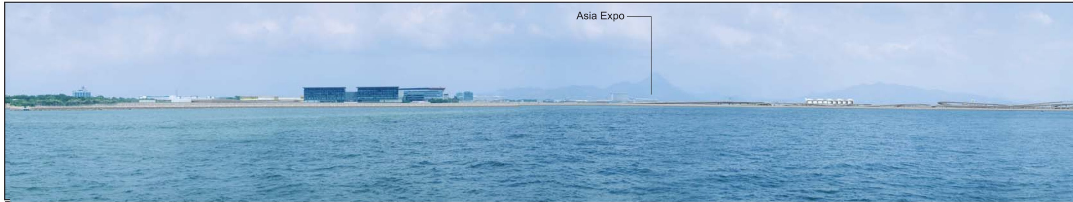
Development without Mitigation (Day 1 of Operational Phase)