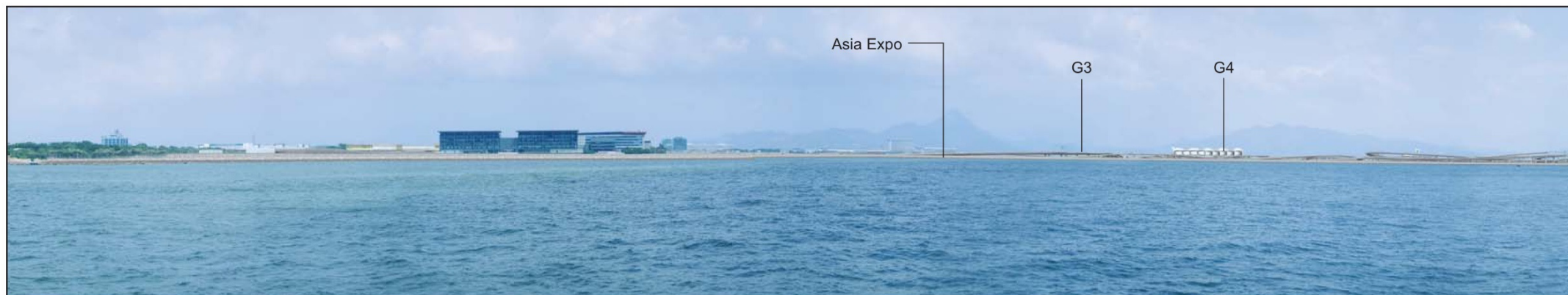
Development with Mitigation (Year 10 of Operational Phase)

Note: Reference to Landscape and Visual Impact Assessment (Ref. 072-02)