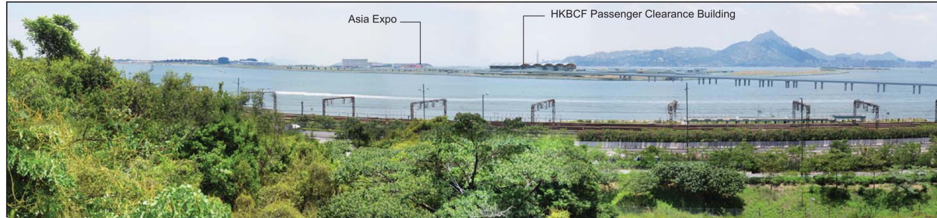
Development without Mitigation (Day 1 of Operational Phase)