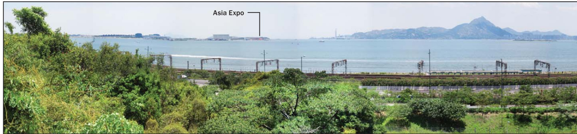
Existing Baseline Condition - Viewing Towards HKBCF (Day 1 of Construction Phase)