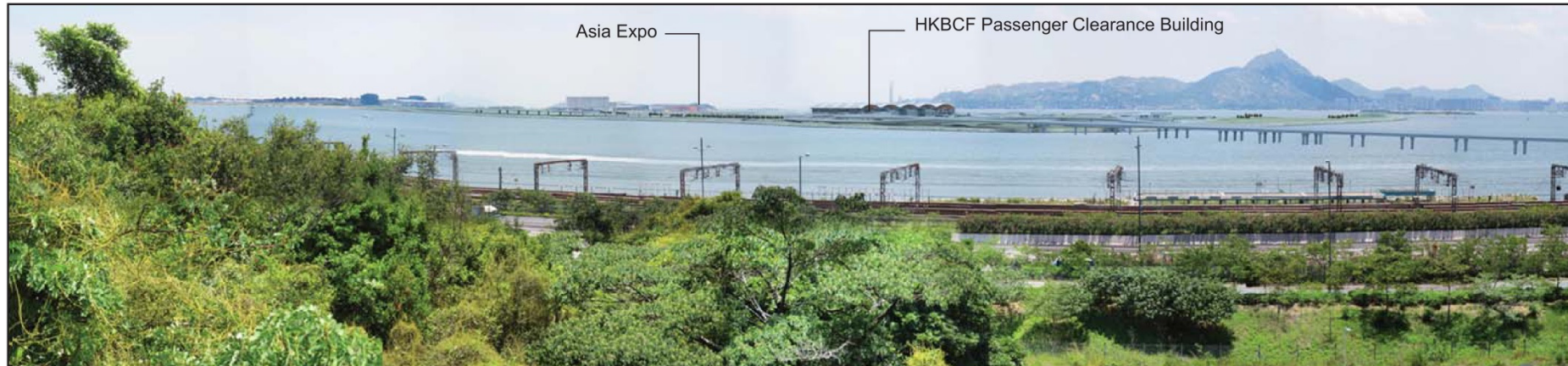
Development with Mitigation (Day 1 of Operational Phase)