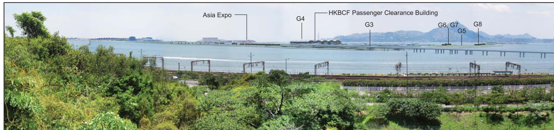
Development with Mitigation (Year 10 of Operational Phase)