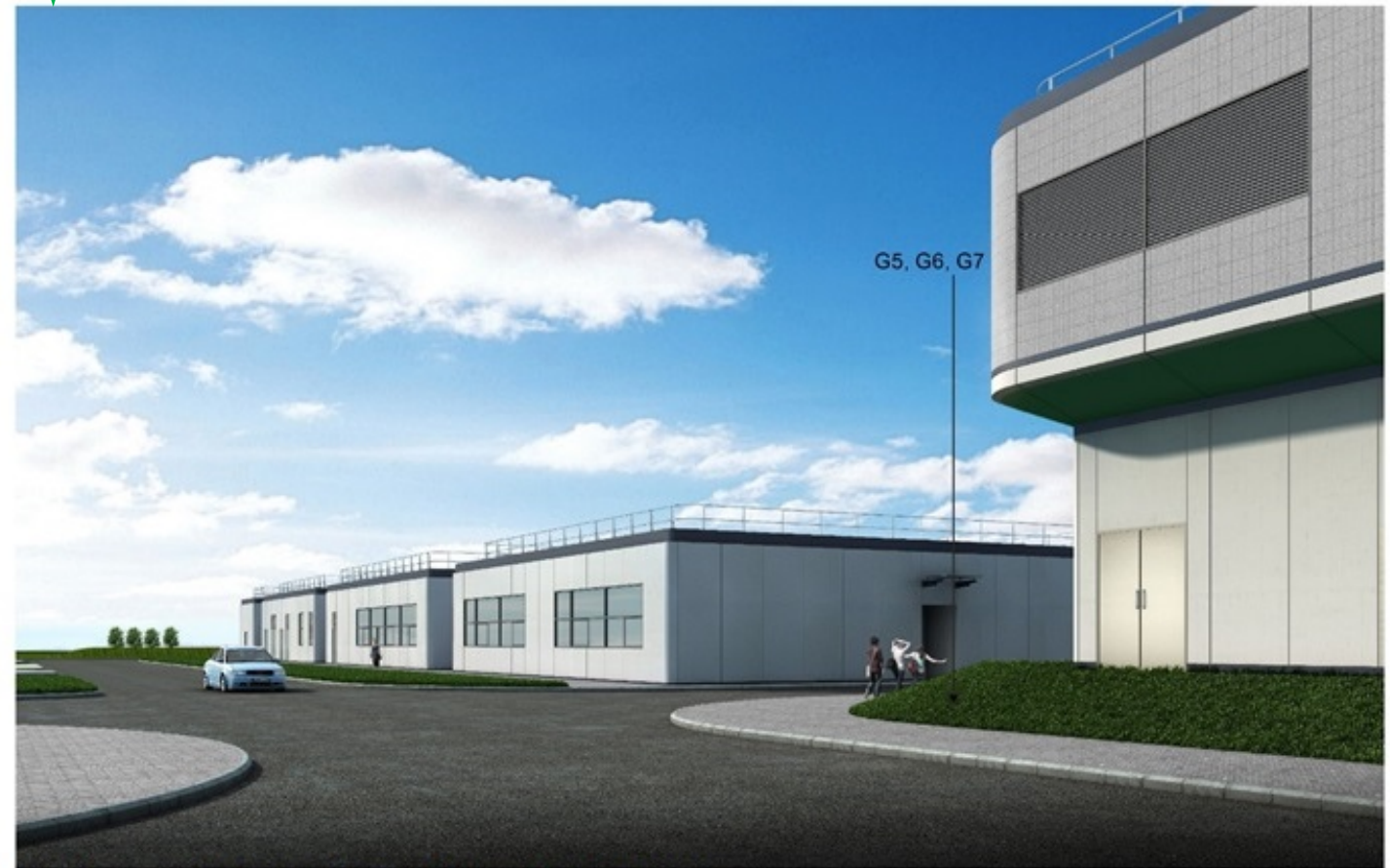
Artist Impression: C&ED Customs Detector Dog Division HZMB Dog Base

Note: Reference to Stage 1 Aesthetic Submission for Building Works and Ancillary Facilities to ArchSD (Ref. 067-04)