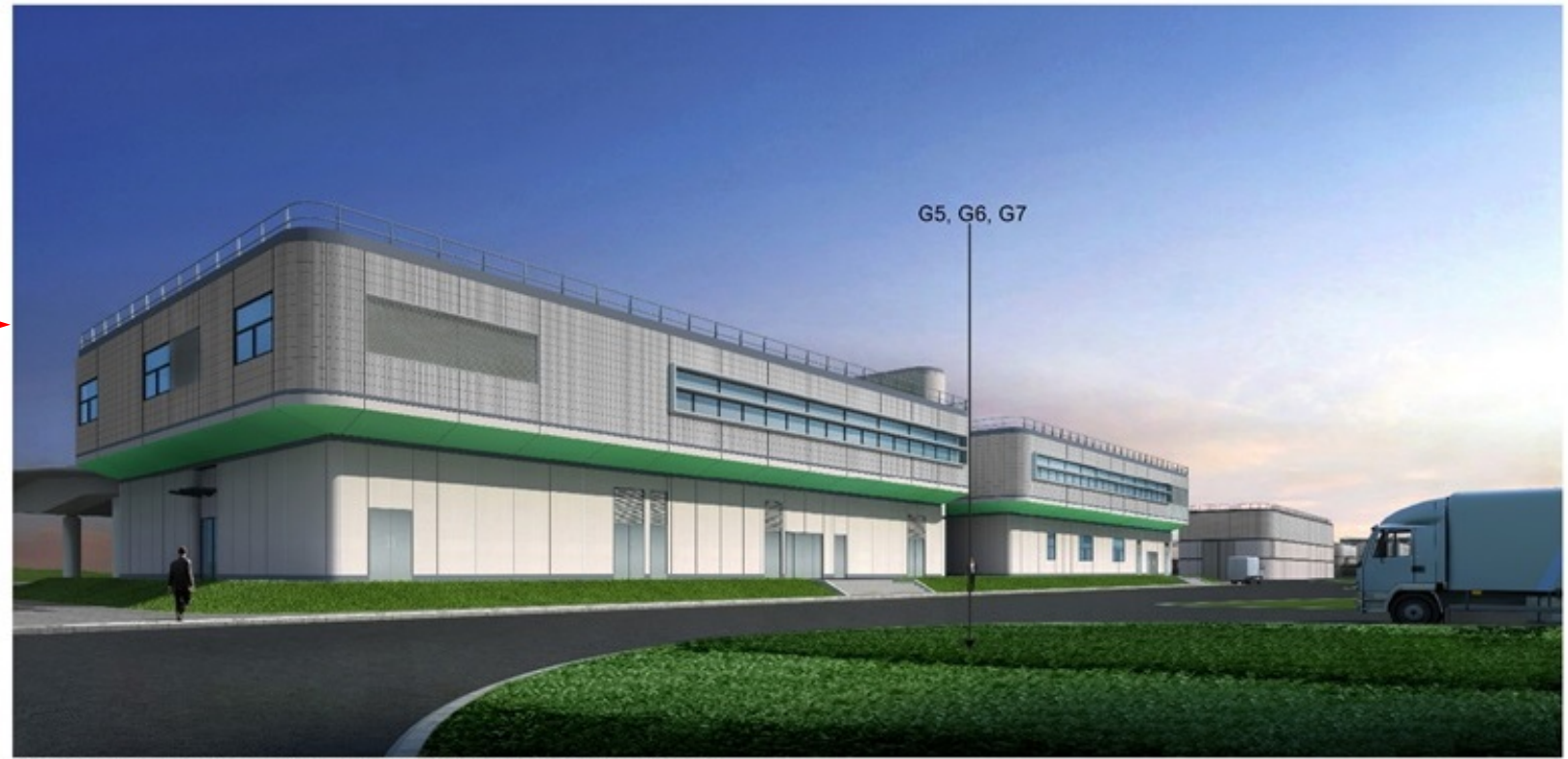
Artist Impression ; C&ED Outbound Cargo Examination Building

Note: Reference to Stage 1 Aesthetic Submission for Building Works and Ancillary Facilities to ArchSD (Ref. 067-04)