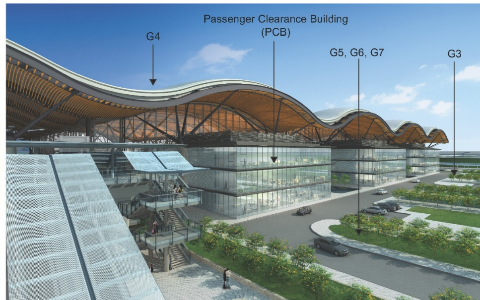
Note: Reference to ACABAS Submission- PCB Main Roof / PTI Canopy (Ref. 173-01)