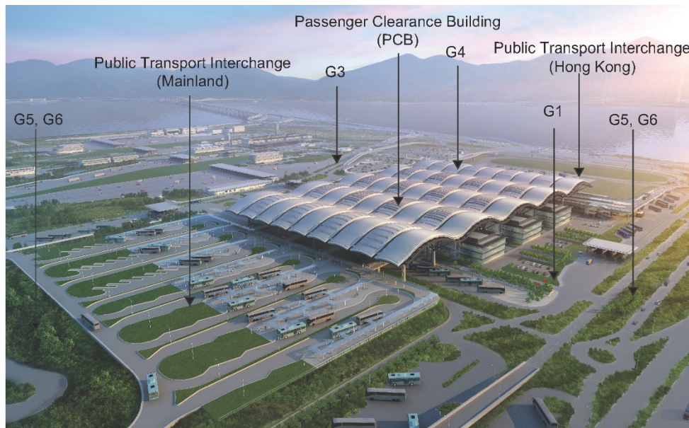
Artist Impression of Passenger Clearance Building Note: Reference to ACABAS Submission- PCB Main Roof / PTI Canopy (Ref. 173-01)